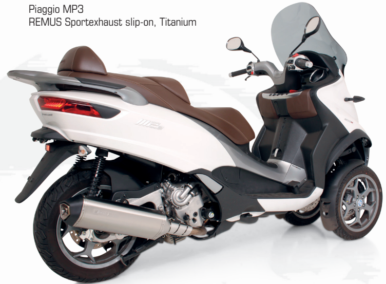
Piaggio MP3 REMUS Sportexhaust slip-on, Titanium